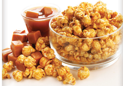
CARAMEL Palomitas con caramelo