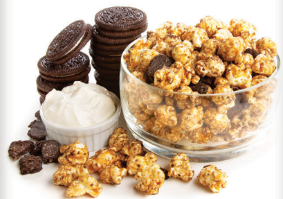
COOKIES & CREAM Palomitas con sabores de galletas y crema