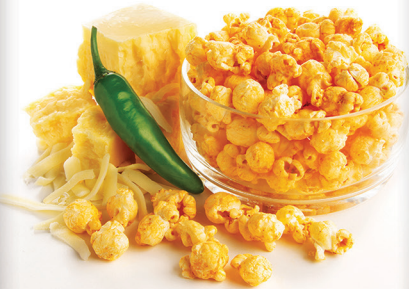
JALAPEÑO WHITE CHEDDAR Palomitas con cheddar blanco y jalapeño