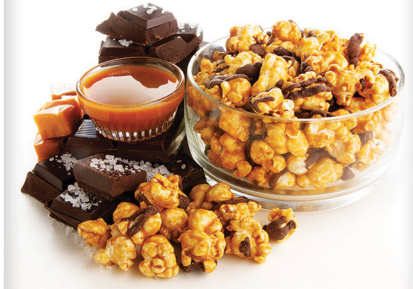
CHOCOLATE DRIZZLE SEA SALT Palomitas con sal del mar y chocolate