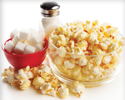
KETTLE CORN Palomitas de "Kettle Corn"