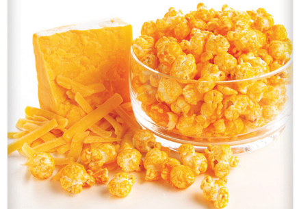
CHEDDAR Palomitas con queso cheddar