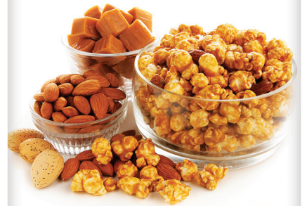
ALMOND CRUNCH Palomitas con almendras crujientes