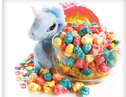
UNICORN Palomitas de "unicornio"