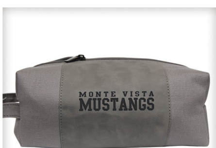
CANVAS TOILETRY BAG