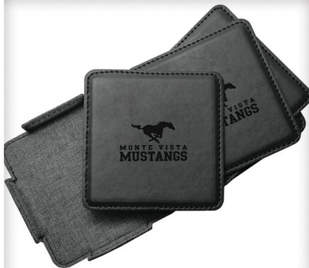
COASTERS (4) AND HOLDER