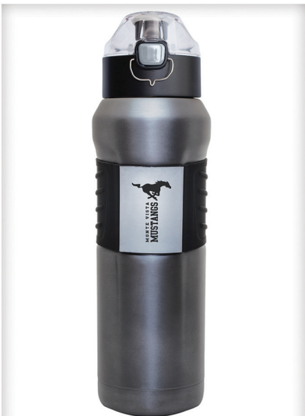
METAL WATER BOTTLE