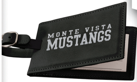
LUGGAGE TAGS (2)