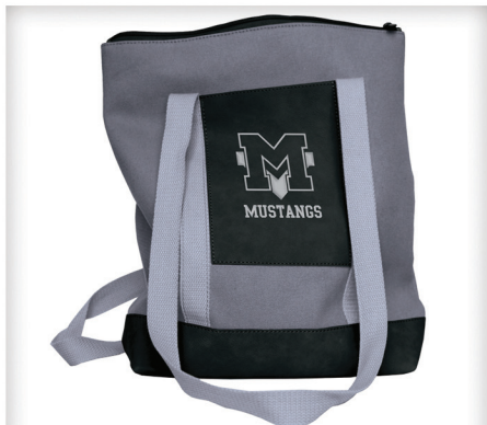
CANVAS TOTE BAG